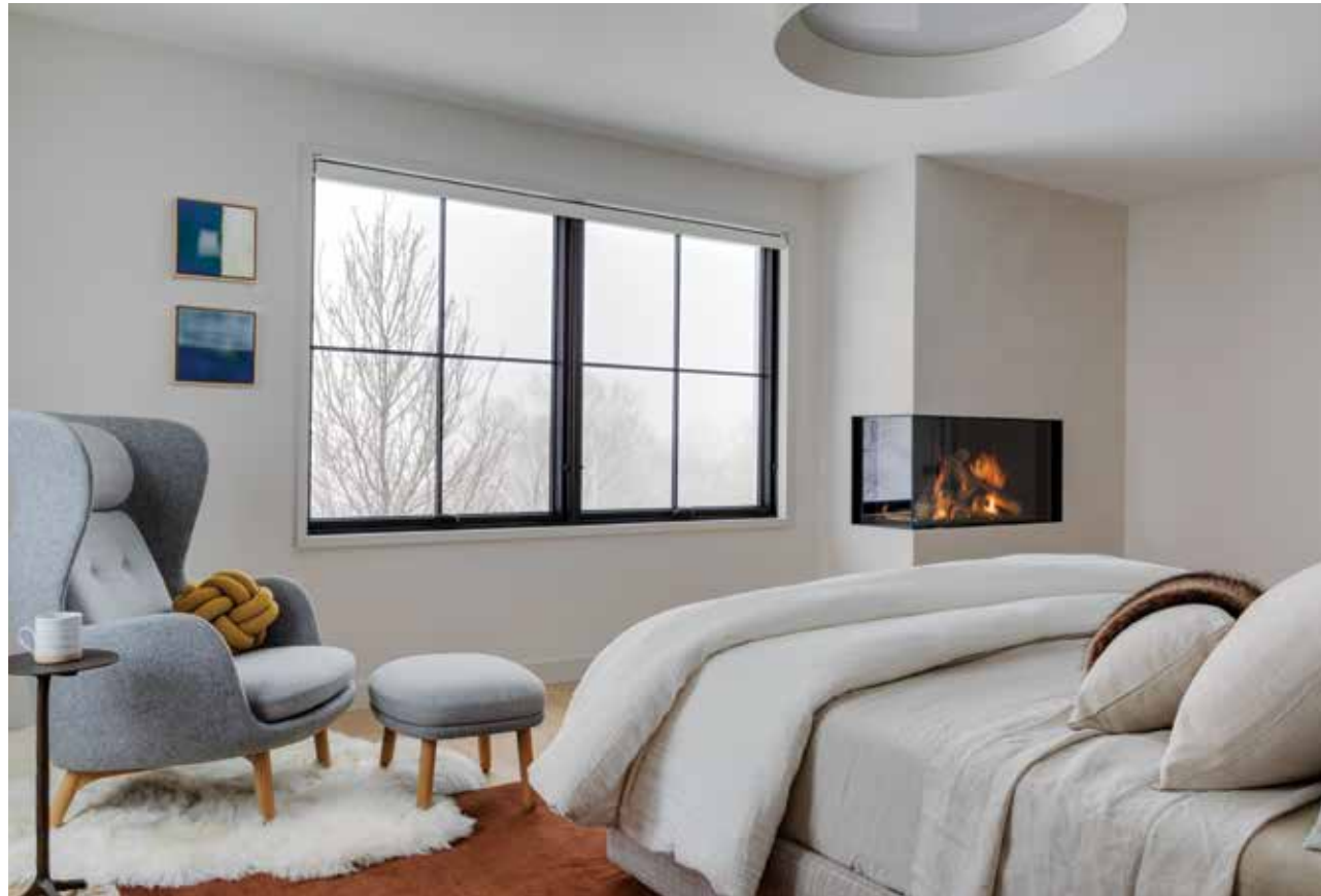
ABOVE: The primary bedroom's gas fireplace is set in the same Tadelakt plaster that is used in the kitchen. RIGHT: Japanese influences continue in the primary bath starting with the sleek black soaking tub. FACING PAGE: The sofa in the conversation pit looks built in but was made to order by Partners in Design of Newton, Massachusetts. It is upholstered with a soft-toned Paul Smith fabric from Maharam.